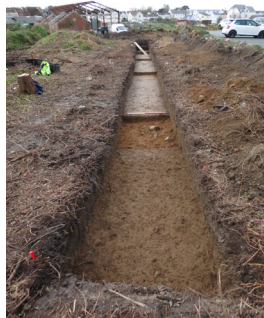
View of evaluation trench at Leale's Yard.

The long-awaited development of Leale's Yard on the Bridge at St Sampson has reached the stage where we have been granted access to excavate a number of evaluation trenches. Our interest is in one area of the site that was not within the Braye du Val and was only partially under glass. This area is to the northeastern side of the site backing onto the Lowlands Industrial Estate. Four trenches have been set out and are now being dug, as yet we have not found any features, but we have recovered prehistoric flint and Saintonge ware (a type of French fine medieval fineware). In addition, post-medieval and numerous modern pottery and vessel glass has been found within the topsoil and subsoil. We have come down onto the natural bedrock which forms a small hougue.