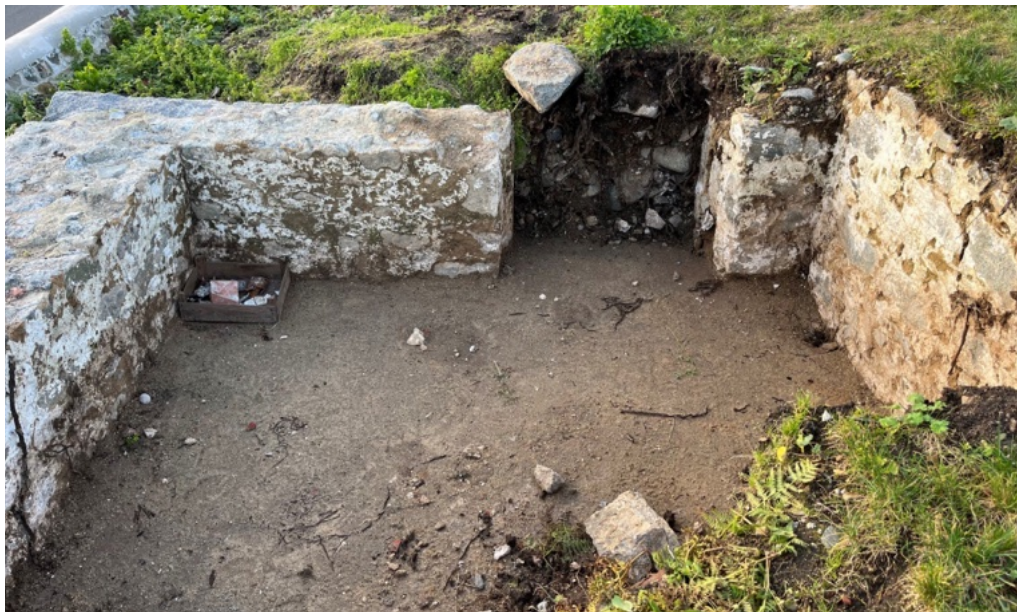
Walls, floor and doorway being exposed at Fort Richmond magazine.

Following the Juniors incredible effort on the Fort Richmond gunpowder magazine excavation in the summer, the rest of the rubble backfill from the magazine was removed. This revealed more Victorian and later pottery, glass and tile. Within the last wheelbarrow full of rubble, a silver George V, one shilling dated 1922 was found. The excavation revealed the surviving walls and the doorway as well as a cement and lime screed floor overlying a grit and sand base layer.