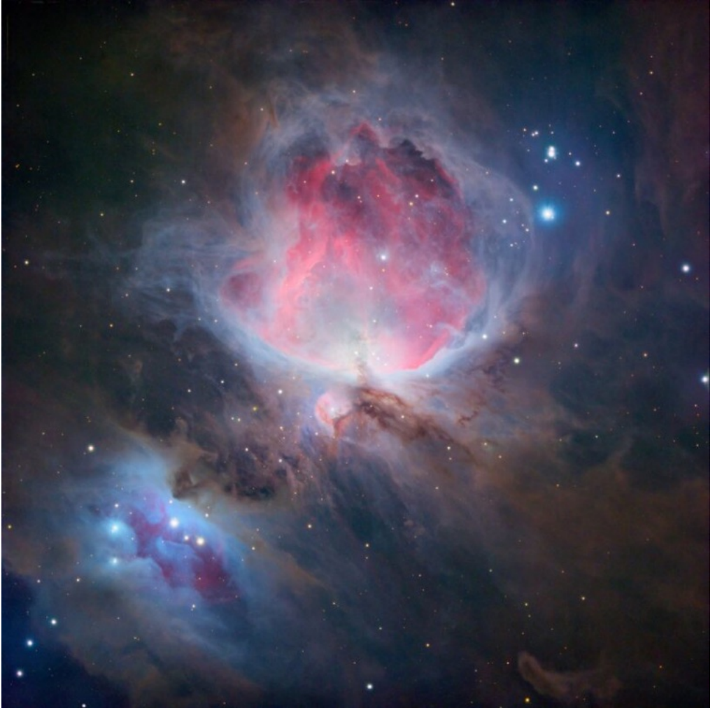
The Orion (top-centre) and Running Man (lower-left) Nebulae. The image covers an area 38 x 38 light-years, T is the Trapezium Cluster. Reds are hydrogen gas; browns are dust and blues are reflected blue/white light from young stars.

Fittingly, believed to be the cosmic fire of creation by the Maya of Mesoamerica, it is an enormous cloud of gas and dust where vast numbers of new stars are being forged. The brightest, central region is the home of four massive, young stars arranged in a trapezoidal pattern (T), unleashing their ultraviolet light, carving a cavity within the nebula and disrupting the growth of hundreds of smaller stars. Jean Dean, Secretary.