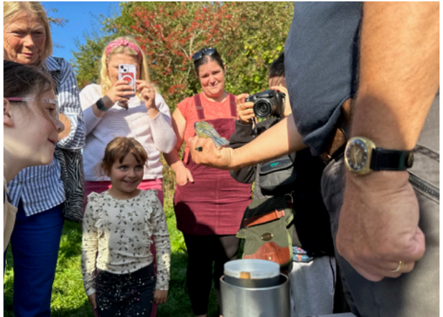
A Blue Tit which was rung at the bird ringing event and being shown to our Juniors. (Bird ringing undertaken under licence).

Our second event in October took place on a windy and stormy day, however we were reluctant to cancel as this was our already rescheduled (and highly demanded) rock pooling event. This event took place at Belle Grève Bay and even the weather couldn't put us off! On the low tide we found an array of crabs, fish and all sorts of other marine creatures with the highlight being a Decorator Spider crab which was very well camouflaged as a piece of seaweed.