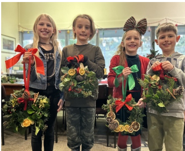
Some of the beautiful wreaths created at our wreath workshops held in December.

In 2023, the Education team held 12 Junior events covering a wide variety of topics, and in total we had 148 junior attendees. We'd like to again take this opportunity to thank the Section Secretaries and members for volunteering their time to help us organise these brilliant events which engage children with our natural environment, as well as our members who attend and support these events.