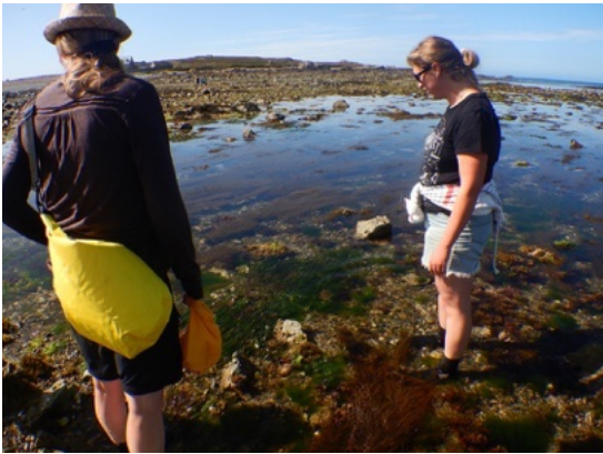
Testing beach walkover surveys.