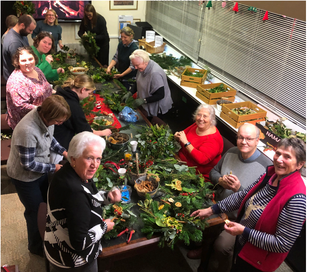
La Société members making their Christmas wreaths fortified by mince pies and mulled wine!

On the subject of wreath-making, it was great fun to lead a members-only workshop in December and we will certainly be offering this popular activity again this year, as well as participating in the various members' events planned for 2024.