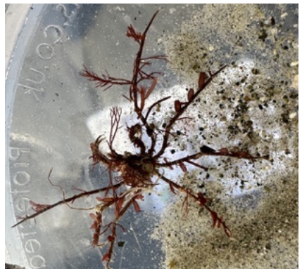
A Decorator Spider Crab found at our rock pooling event.

Our second event in October took place on a windy and stormy day, however we were reluctant to cancel as this was our already rescheduled (and highly demanded) rock pooling event. This event took place at Belle Grève Bay and even the weather couldn't put us off! On the low tide we found an array of crabs, fish and all sorts of other marine creatures with the highlight being a Decorator Spider crab which was very well camouflaged as a piece of seaweed.