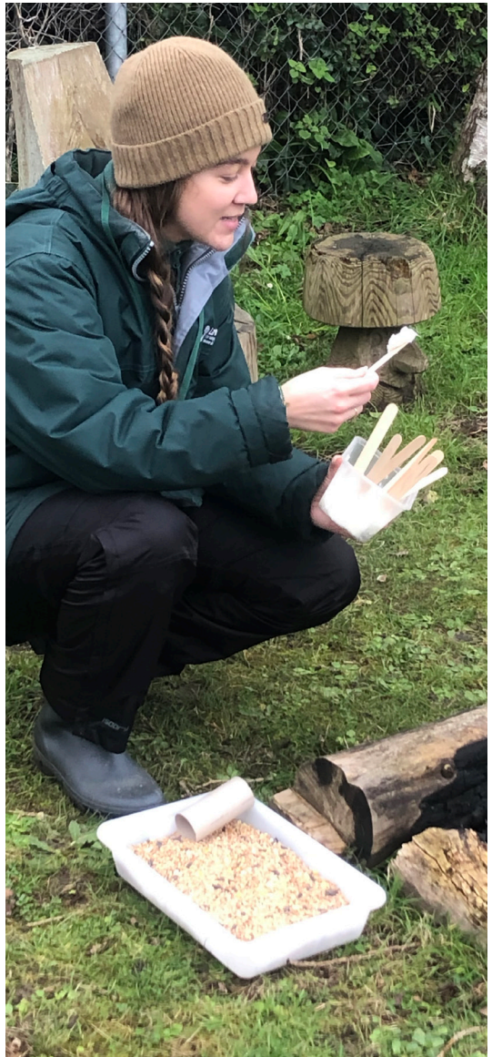
Making birdfeeders as part of an education session.