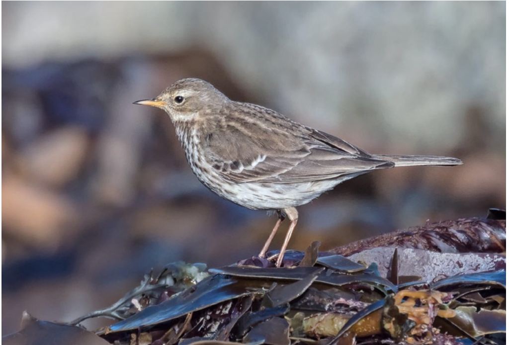
Water Pipit.

Wheatear (Common) at Perelle on 20th November (MAG). Last reported date.