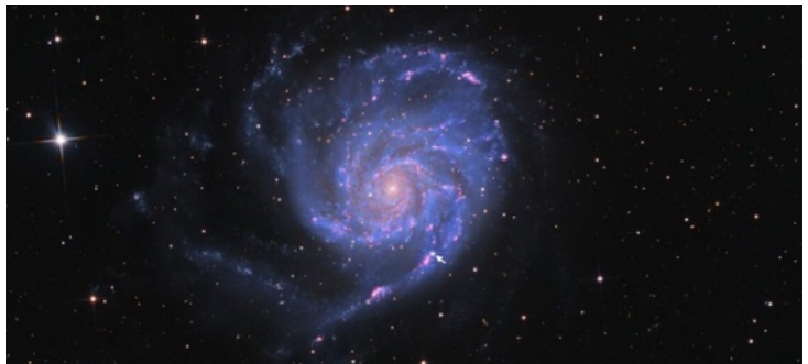
Messier 101, Pinwheel Galaxy and SN 2023ixf.