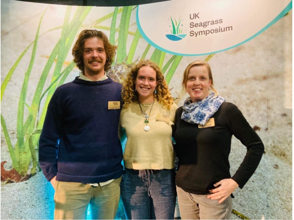
BEEP attending UK Seagrass Symposium.