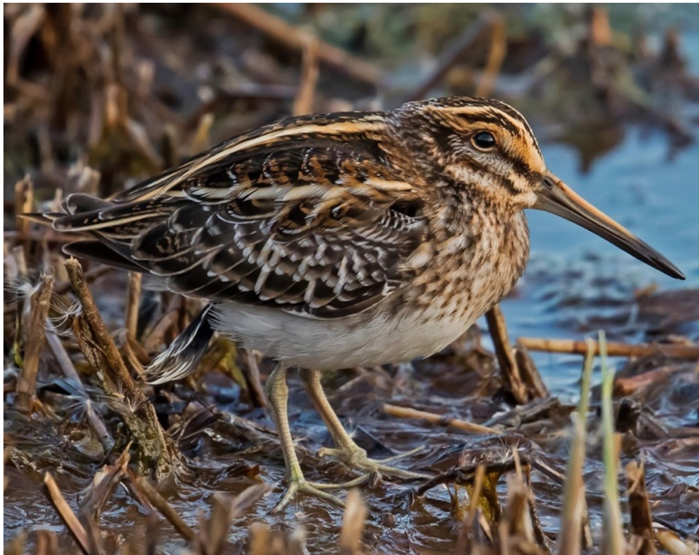
Jack Snipe.