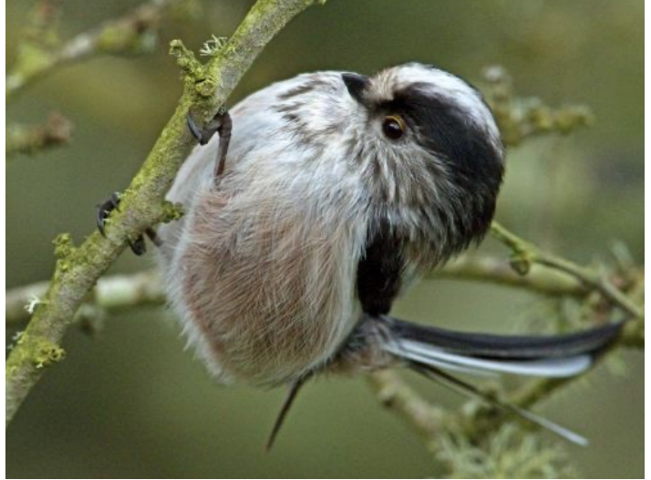
Long-tailed Tit.