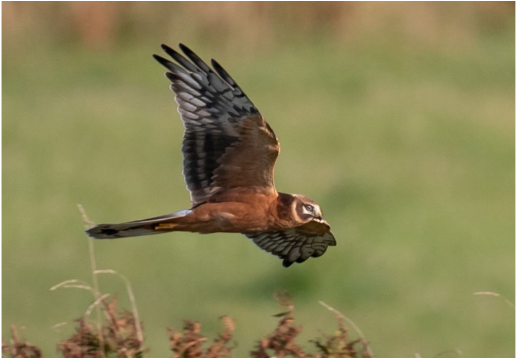
Pallid Harrier.