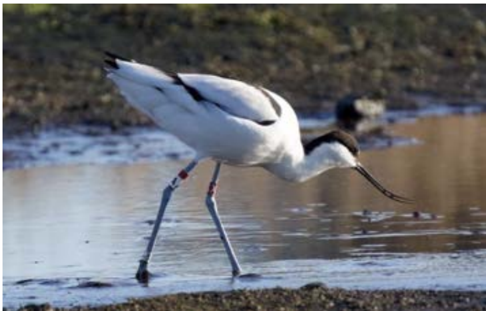
Avocet