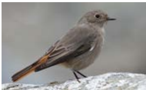
Black Redstart