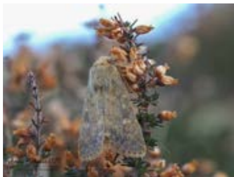
Brindled Ochre Andy Marquis

Brindled Ochre at Pleinmont and five Feathered Thorn at Saints. It will be interesting to run traps “out of season” at locations around the island, the cliffs especially, to record the moths whose flight period is at the start and end of the traditional moth trapping season which is often considered as April to late September.