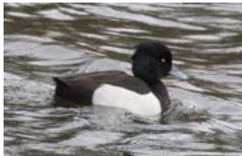
Tufted Duck