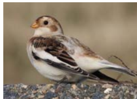
Snow Bunting, Julie Day

An elusive Dartford Warbler was present at Pleinmont in early December (DJC). The photo is from earlier in 2024.