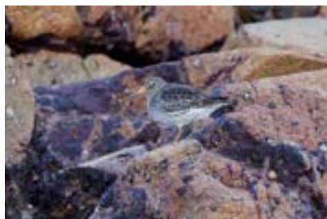
Purple Sandpiper, Dave Carré

Numbers of Purple Sandpiper continue to dwindle. One was seen at Fort Hommet on 11th November, (MAG) and only a single bird has been recorded at Jaonneuse from 7th December (APL)