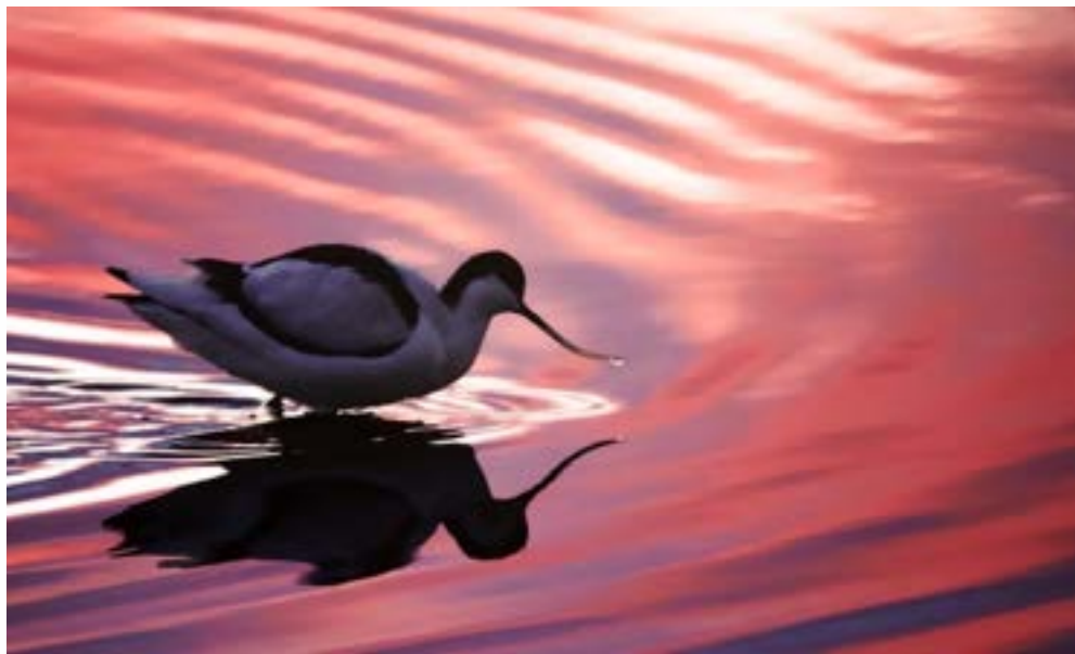
Avocet, La Claire Mare Nature Reserve