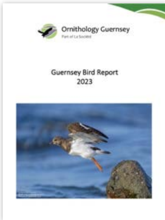
Cover of the Guernsey Bird Report 2023

The December meeting was a social gathering open to everyone. After light refreshments there was a presentation showcasing some of the birds photographed in Guernsey in 2024.