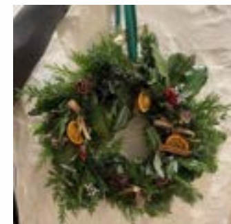
Wreath making workshop.