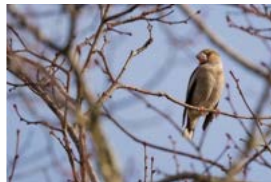
Hawfinch