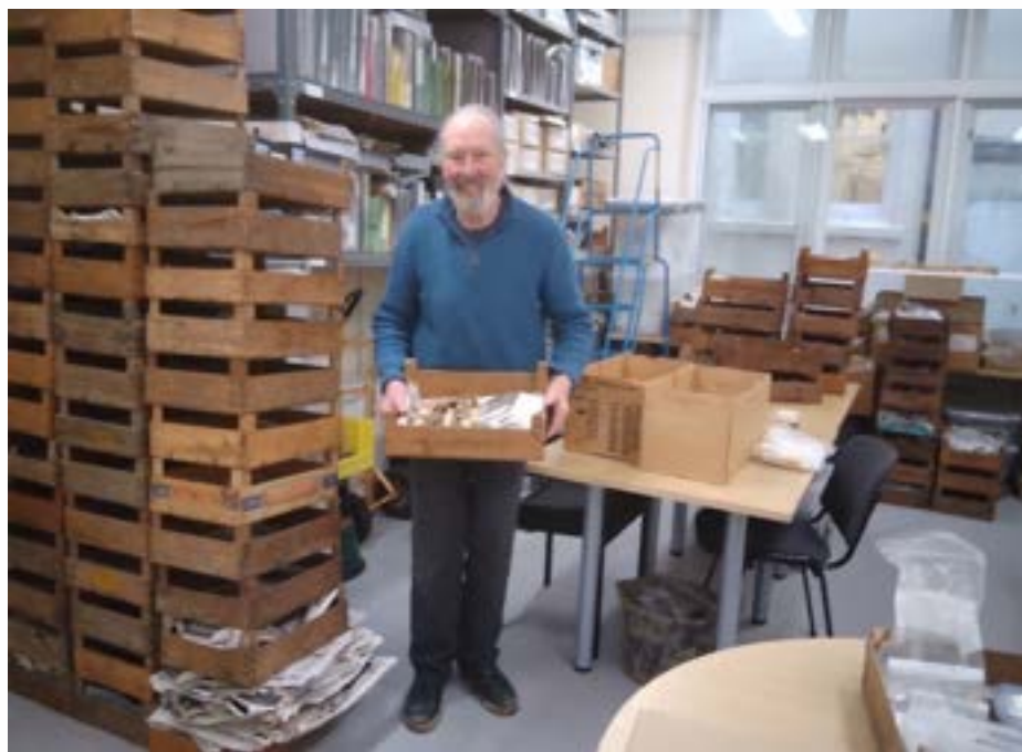
Finds from the drawbridge pit excavation.

A display about the excavation can currently be seen at Guernsey Museum and there will also be a talk on the subject in March (see below for details).