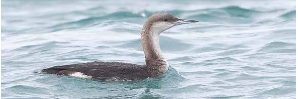
Black Throated Diver

Winter is a good time of year to look seawards. There have been good sightings of Black-throated Diver and Great Northern Diver. Great Crested Grebe can usually be observed around Salerie Corner and Belle Grève Bay in the colder months. This year was no exception, with three individuals sighted early in the month at Perelle and another three opposite the Red Lion. Red-necked Grebe, Slavonian Grebe and Black-necked Grebe have also been seen.