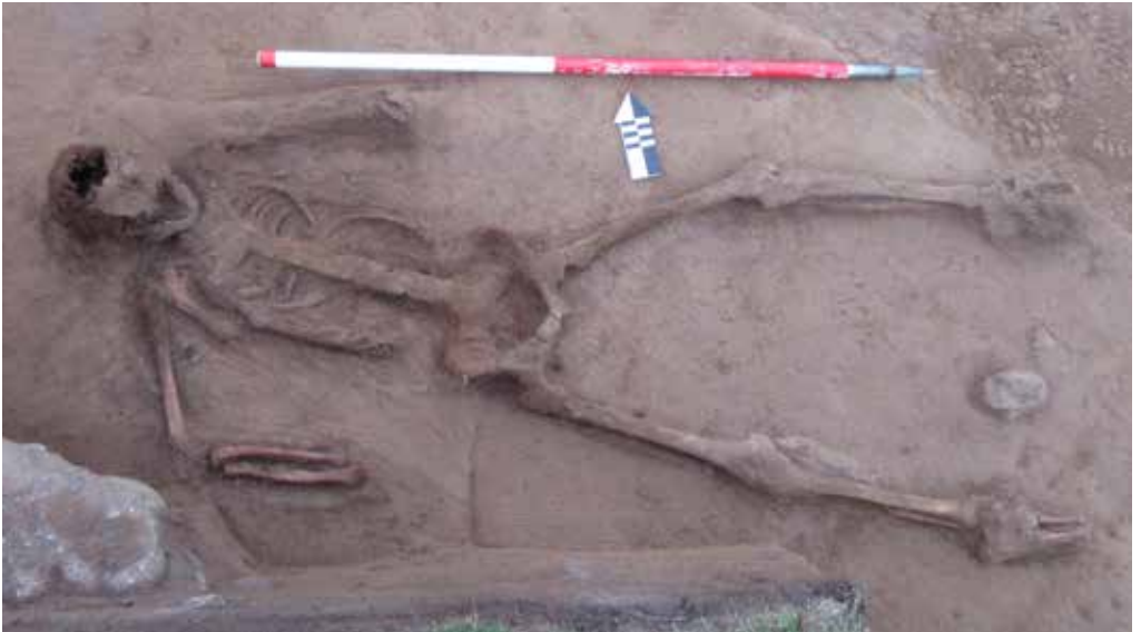
The skeleton in situ. Scale is 1m - photograph courtesy of Philip de Jersey.

There is more to do, but the analysis so far has revealed that this was a young man, no older than late 20's. The buttons have been sent away for specialist conservation and initial reports show that there are six of leather, a large flat copper alloy one and three of horn with copper alloy loops. A portion of textile has survived attached to one of the buttons and this is probably wool. Once the conservation is complete we will seek specialist identification of the buttons and it should be possible to say what kinds of garments they were from. We will also get a radiocarbon date for the skeleton.