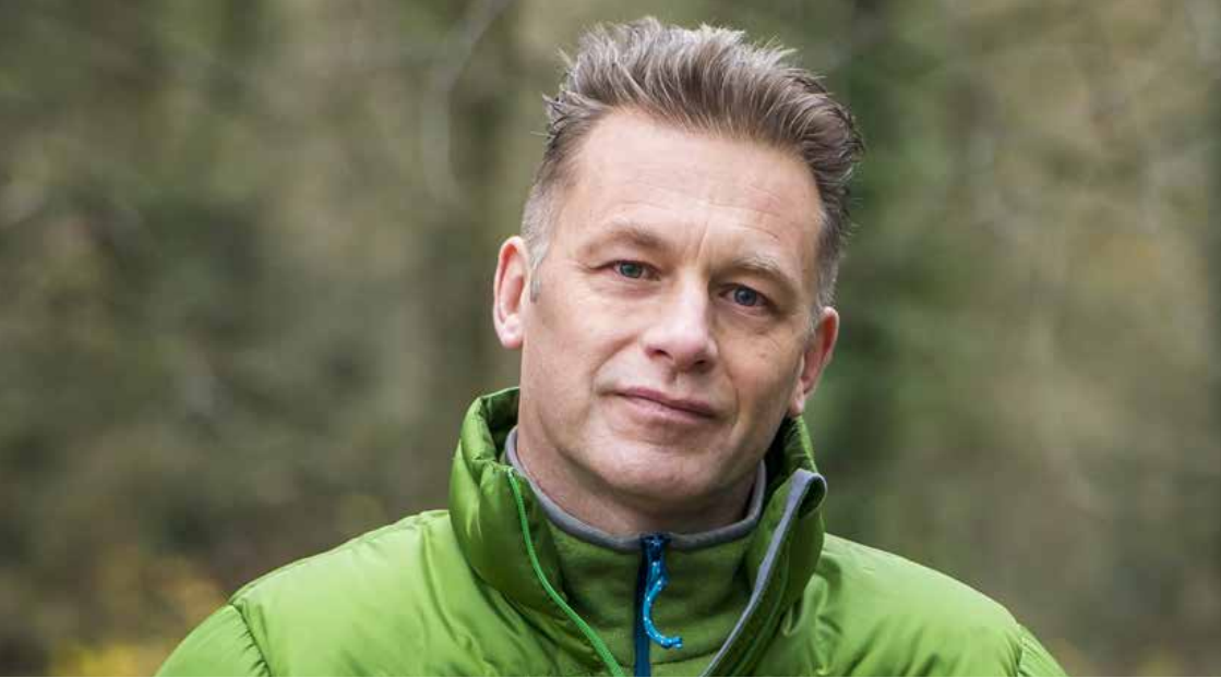
Chris Packham

For nature, history and science in Guernsey