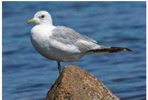
Common Gull – photograph courtesy of Anthony Loaring.

Six species of Gull were recorded in January 2019, including Common Gull which is not common in Guernsey. It is worth noting here that many Herring Gull and other local Gull species have been ringed and there is a website where ring codes can be recorded and, with luck, it is possible to follow an individual's history. The more sightings that are recorded, the more detailed a picture can be built up. One Great Black-backed Gull was recently photographed at Rocquaine. His ring code revealed that he was ringed in June 2016 near Le Havre. There have been other sightings of the same bird near Cherbourg, Chouet, West Bexington in Dorset and again in Guernsey. If you are able to note down any gull ring codes, they can be recorded online at birdrings.digimap.gg