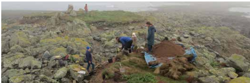
Excavation of the body on the smaller section of Chapelle Dom Hue

The Section regularly visit La Chapelle Dom Hue to monitor erosion and check for finds, in March last year we were surprised to discover a human toe bone and then later in the year a second one; it seemed likely that there was a burial gradually eroding out. The decision was made to carry out a small excavation to see if this was the case and, if so, to remove the remains. Left in situ the skeleton was likely to erode out by degrees which would have been undesirable for many reasons.