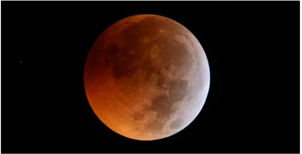
Eclipsed Red Moon

On January 29th Elaine Mahy gave us an excellent technical talk on how she successfully photographed the eclipsed red moon, in spite of cloud and the early hours of the morning.