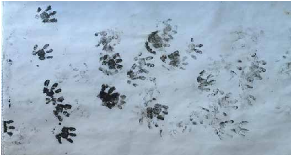
Hog prints

The tunnels detected hedgehogs for all four weeks of the study, however there were more instances of hedgehog detection in dune grassland habitat than there were in pastureland. The first week at pastureland I detected hedgehogs 4% of the time, and in the second week 18%. On the dune grassland, the first week I detected hedgehogs 42% of the time and in the second week 52%.