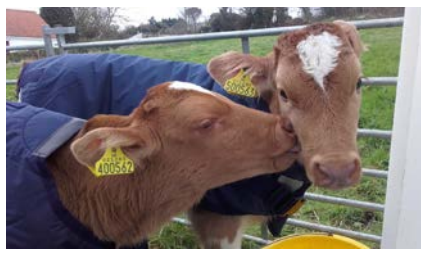
The two new members of the Herd; Nine and Ten.