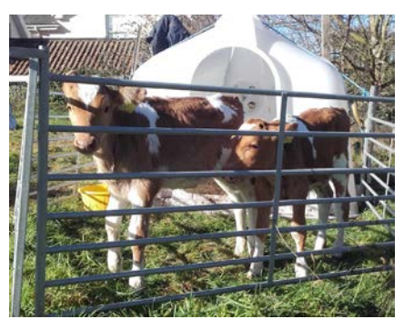
Nine and Ten in their calf hutch.