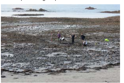
Line of Stakes: Members of the Archaeology Group along the line of the stakes.