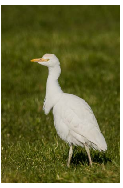
Cattle Egret.

Unlike most herons these egrets are not reliant on wet habitats and this probably explains their success. Their name gives a clue as to where they like to be - in fields foraging among cattle or even on the backs of buffaloes or elephants, helping to rid them of parasites. We are fortunate to have their cousins Little egrets, resident and breeding here, so, how do we tell them apart?