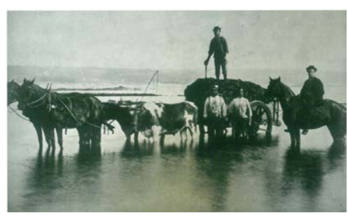
Vraic gatherers on the West coast.

The growth of the town of St. Peter Port stimulated local agricultural production and crop rotations developed by trial and error contributed to the