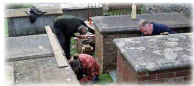
Restoration of tombs in the Brothers' Cemetery – photograph courtesy of Philip de Jersey